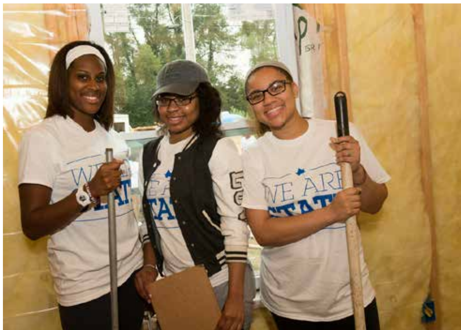
Indiana State University

Stewards of place also attend to the broader opportunity available in their