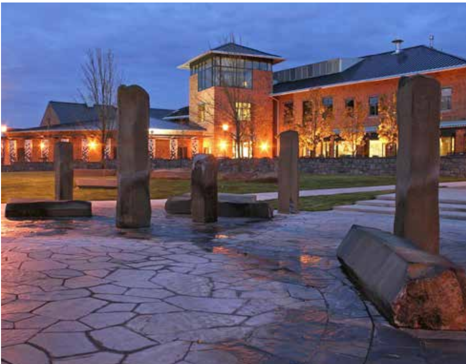
Washington State University Vancouver

Understanding the value of postsecondary education through measures of upward mobility and return on investment is a hallmark of the new postsecondary context. Many of these analyses have demonstrated that RPUs outperform many other institution types when it comes to promoting students' upward mobility. One analysis found that in a sample of 307 RPUs, more than half the students raised in households in the two lowest-income quintiles managed to reach the two highest income quintiles by their 30s (Klor de Alva, 2019). In a ranking of the top institutions based on their economic mobility index score, AASCU institutions predominate, especially institutions in the California State University and City University of New York systems (Iitzkowitz, 2022). The upward mobility that RPUs propel is not just significant for individuals. It helps uplift and create new opportunities for families. Given that AASCU institutions are often educating students from their regions, changing the economic fortunes of students and families can foster positive spillover effects for the economic prosperity of regions.