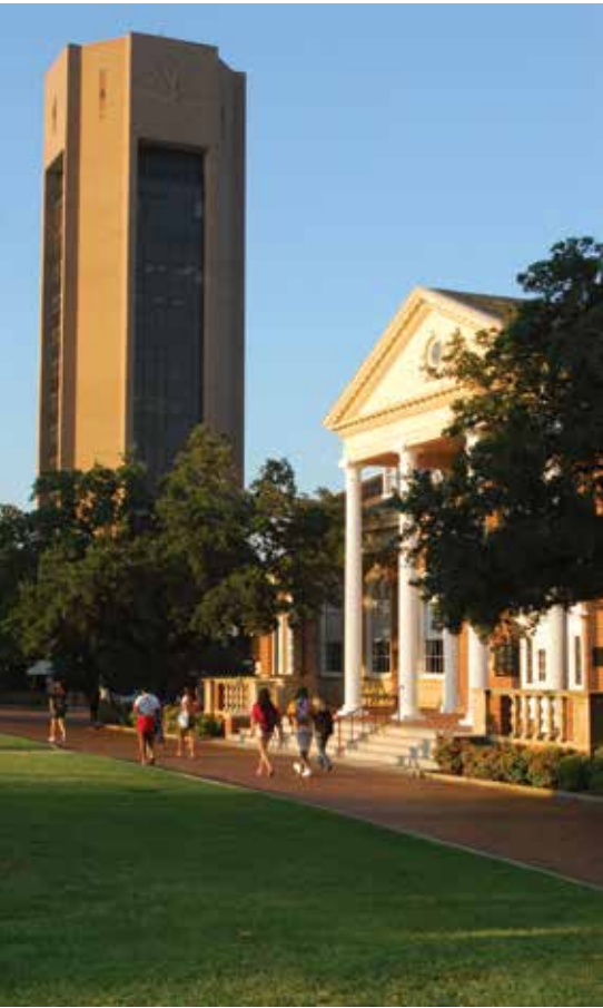
Texas Woman's University

The report then articulates the following eight principles of stewardship of place, which can serve as a guide and ballast for AASCU institutions when meeting future challenges and opportunities. These principles comprise the philosophical underpinnings of stewardship of place: