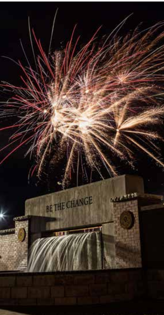
Northeastern State University (OK)

very core of our democracy; we have witnessed racist and sexist attacks on the new majority—African Americans, Latinos, LGBTQIA+, Asian Americans, and women. Gun violence has risen exponentially in our communities, and we are witnessing a country deeply polarized by party lines. And now, we are experiencing inflation, impacting the economic lives of our country's most vulnerable, the low- and middle-income populations; the very individuals AASCU institutions serve.