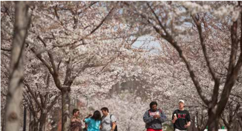
Western Kentucky University

nors, inculcating civic skills within students, and claiming and leveraging their status as public institutions in the democratic sense of the word, AASCU institutions will live into the stewardship of place mission in ways that serve democracy and strengthen local economies. College campuses can also be anchor convenors for balanced public debate or contested spaces of political conflict.