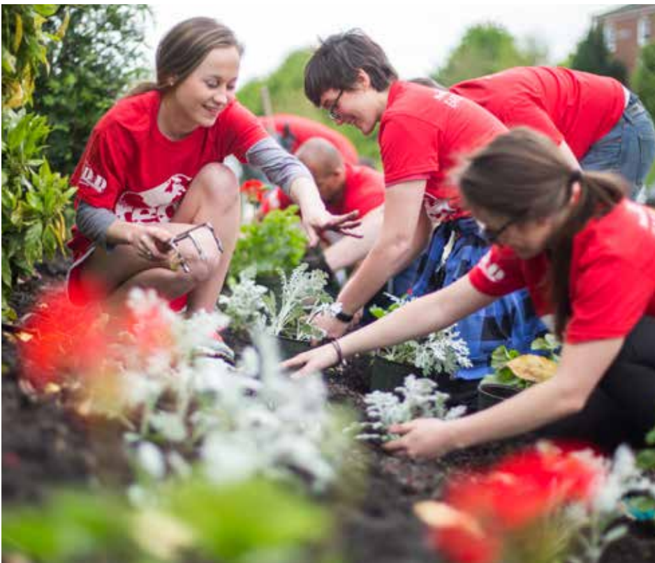
Austin Peay State University (TN)

Yet today, AASCU institutions continue to be stewards of place in a different context. Today we recognize that the country demographics have changed whereby people of color are becoming the new majority of America. Our country has also experienced a worldwide pandemic never experienced in our lifetimes, affecting the way institutions deliver education and the way we live. We have lived through an insurrection hitting the