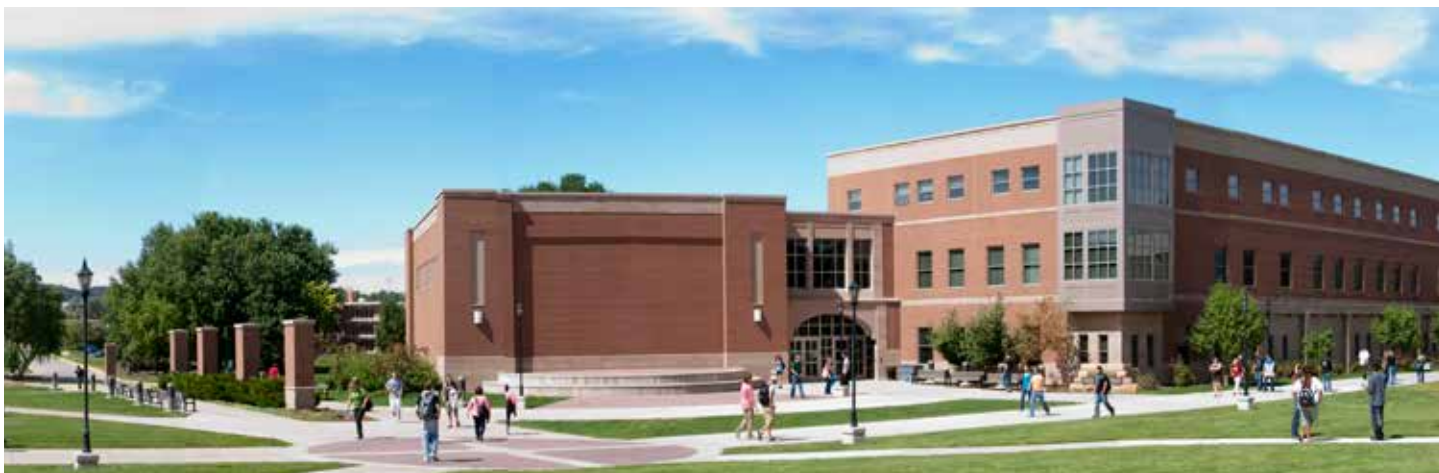
Black Hills State University (SD)

of Teaching's Elective Classification for Community Engagement. The Carnegie definition of community engagement closely resembles how the original guide defined public engagement, calling it "the collaboration between institutions of higher education and their larger communities (local, regional/state, national, global) for the mutually beneficial creation and exchange of knowledge and resources in a context of partnership and reciprocity" (p. 2). The elective classification is described as a benchmarking tool, and the designation is based largely on descriptive information that institutions submit. Rather than creating a hierarchy, the classification is designed to help institutions share their unique approaches to community engagement and