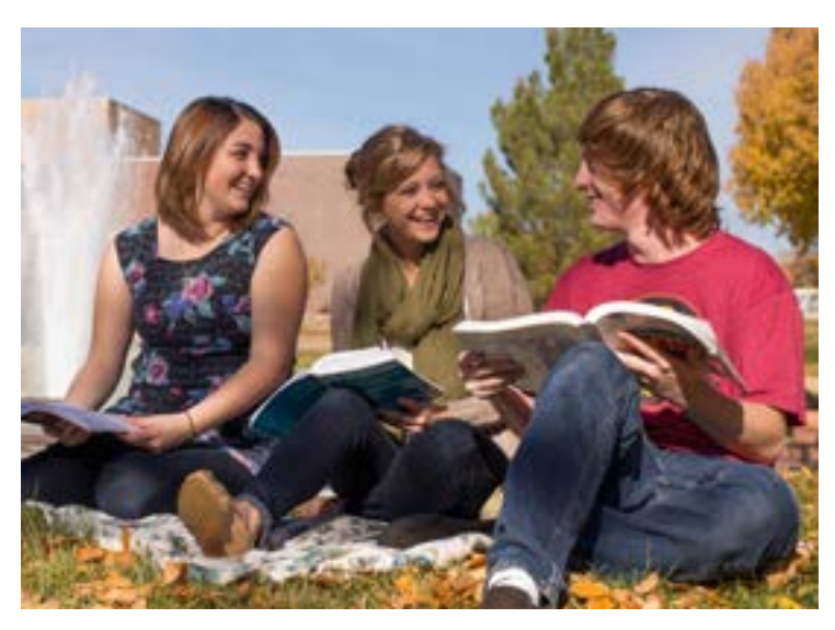
Dixie State University (Utah)

USI treats dual-credit teachers essentially as adjunct faculty. They work directly with a faculty liaison who observes the teacher in the classroom and offers feedback. Dual-credit teachers have affiliations with a USI academic department, are invited to departmental meetings, and can attend summer workshops to deepen their content knowledge. "These teachers really feel that they are valued for what they are doing in their classrooms," Dumond says, "and they get good feedback on their ideas and approach to teaching." More than 50 percent of teachers in the dual-credit courses are USI alums, and Dumond says their work through CAP helps keep them connected with the university.